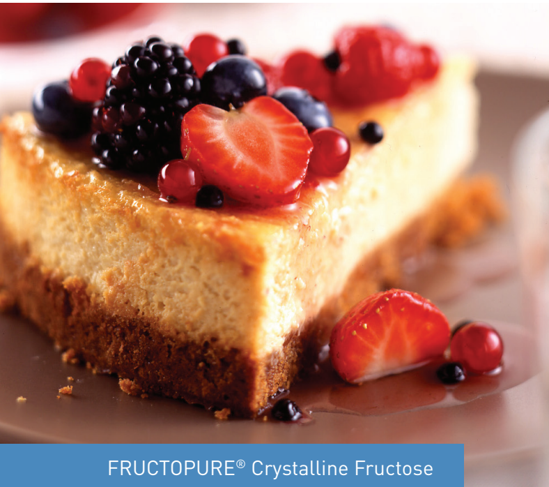
FRUCTOPURE® Crystalline Fructose